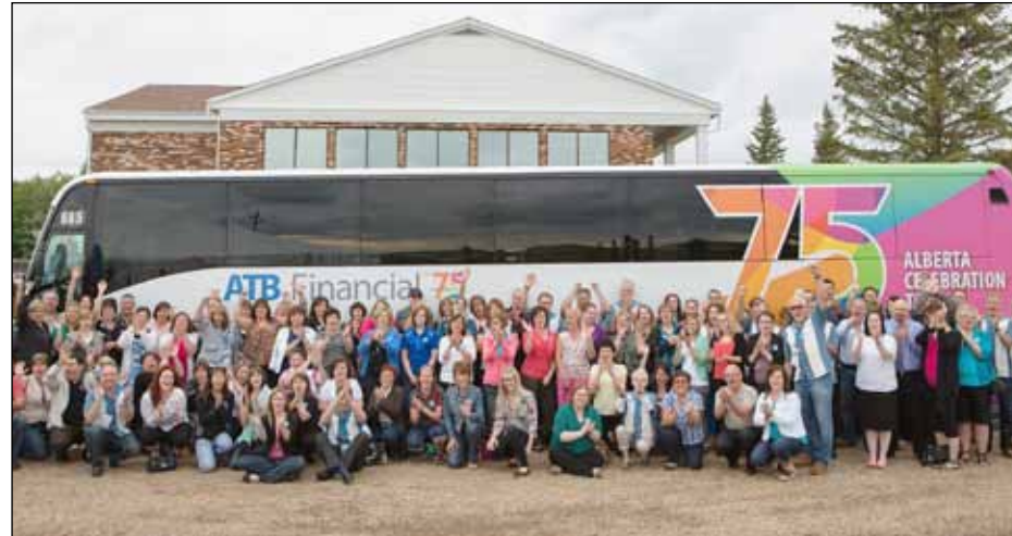
ATB Financial, which employs more than 5,000 people, celebrated 75 years in 2013. The company is active in the community, raising millions for charities such as the Calgary Children's Hospital and the United Way.

ATB team members also raise funds for United Way agencies provincially, raising more than $6 million to date.