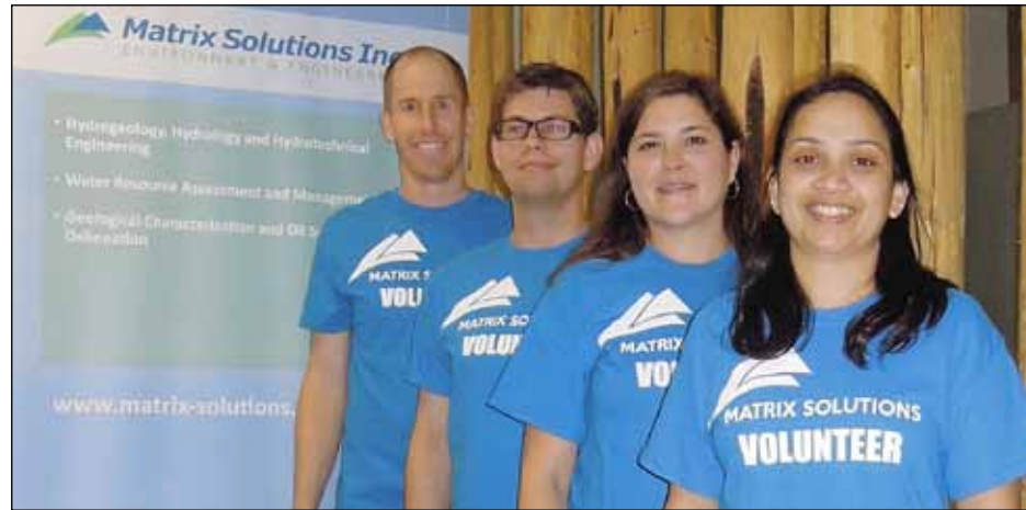
Matrix Solutions' volunteer programs are employee driven. Thanks to flexible work hours, employees are able to volunteer in the communities they serve.

“In addition to internal training programs, each employee has an annual profes-