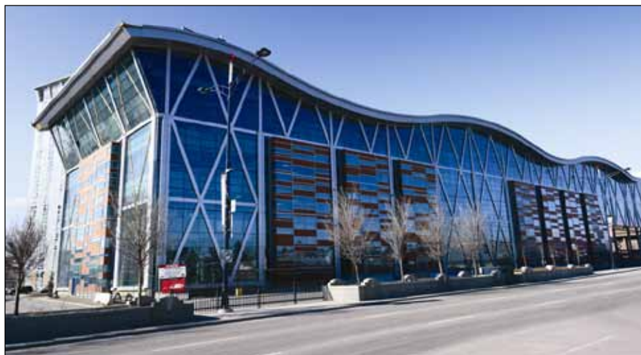
SAIT Polytechnic's 440,000-square-foot Aldred Centre (top and below) opened in late August 2012. The building houses the Enerplus Centre for Innovation and main office for the School of Construction.

"The two in combination make for a constructive work environment."