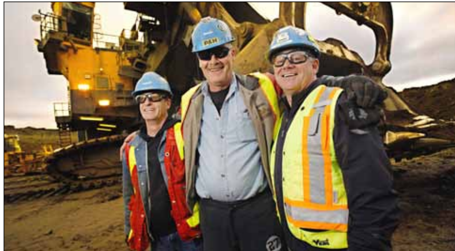
Suncor's employees help the company generate 375,000 bpd from its operations in Alberta's oilsands, and another 190,000 bpd from other operations (averaged as of the first nine months of 2013).

munities where it operates, donates to community projects where employees volunteer and maintains an industry-leading environmental stewardship program.