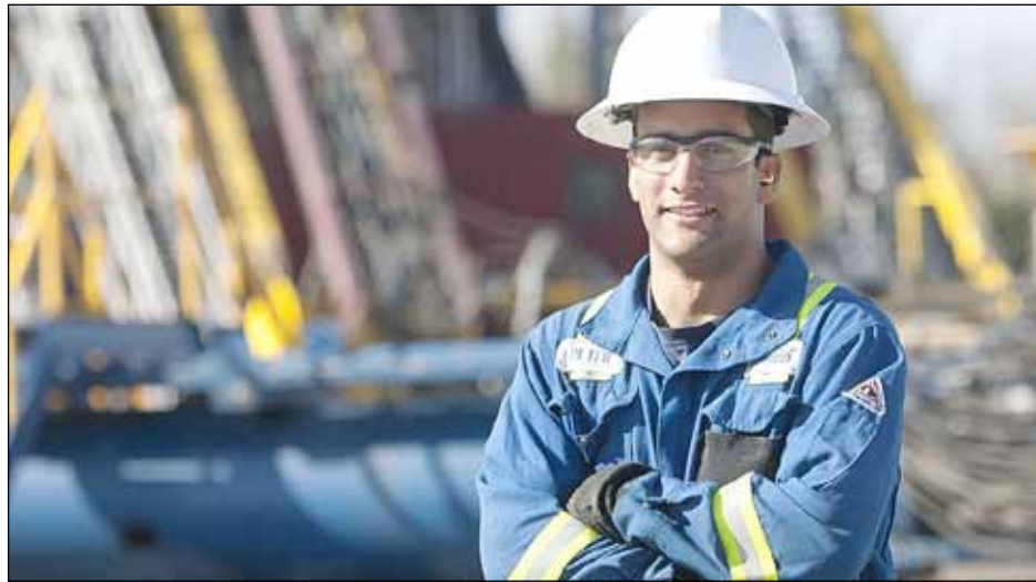
Under CNOOC Ltd., Nexen employees have additional access to opportunities, resources and expertise.

Many of Nexen's employees are engaged in the implementation of innovative technology, which continues at the Long Lake