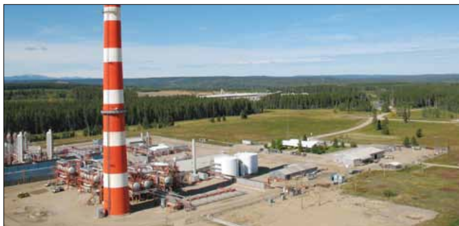
Keyera, a Calgary-based mid-stream service provider, focuses on natural gas gathering and processing, as well as the processing, transportation, storage and marketing of NGLs.

"Keyera offers an engaging, respectful and collaborative work environment that is buzzing with opportunities. Our management team is approachable and accessible to our employees, and we have tools in place to stay connected."