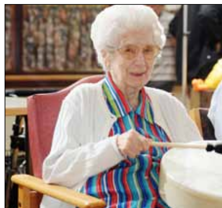
Programs focus on the changing needs of seniors.

and relationship focused, in an environment that is safe, comfortable and that engages residents to participate in the community.”