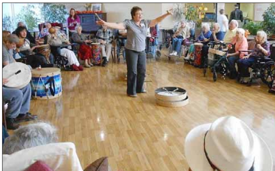
Keeping bodies and minds as active and healthy as possible is part of Bethany’s care philosophy.

“The CARE-Count Me In! initiative defines the principles of Bethany’s philosophy of care being person-centred