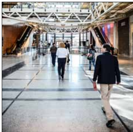
At SAIT, fairness, integrity, respect, safety and transparency are priorities, and form SAIT's FIRST ethical principles. "We want people to feel they are part