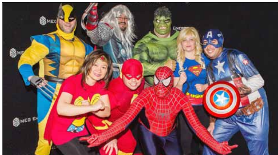
MEG’s culture is one that has been built on having fun, working hard and celebrating successes. Throughout the year, MEG hosts a number of social functions ranging from hockey tournaments to family parties.