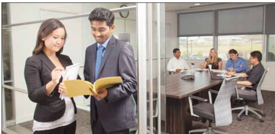
Fluor offers employees the ability to build diversified careers without ever leaving the company.

project incentive plans for certain contracts that provide individual bonuses for meeting client key success metrics, notes Conroy.