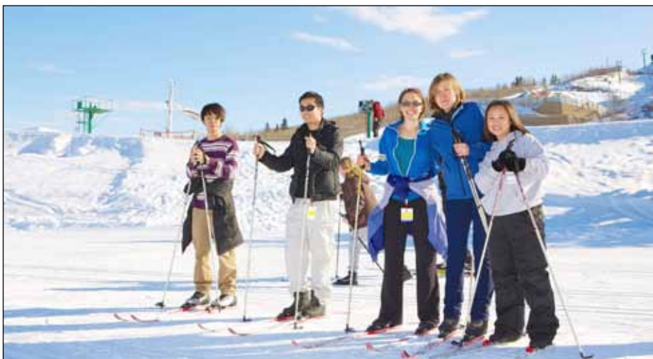
At the 2013 AltaGas Family Ski Day employees brought members of their family for a fun day at Canada Olympic Park.

As a large project developer, AltaGas makes safety a first priority of its corporate culture, Dulmadge says. The culture also emphasizes work-life balance, with flex days and personal days off, as well as