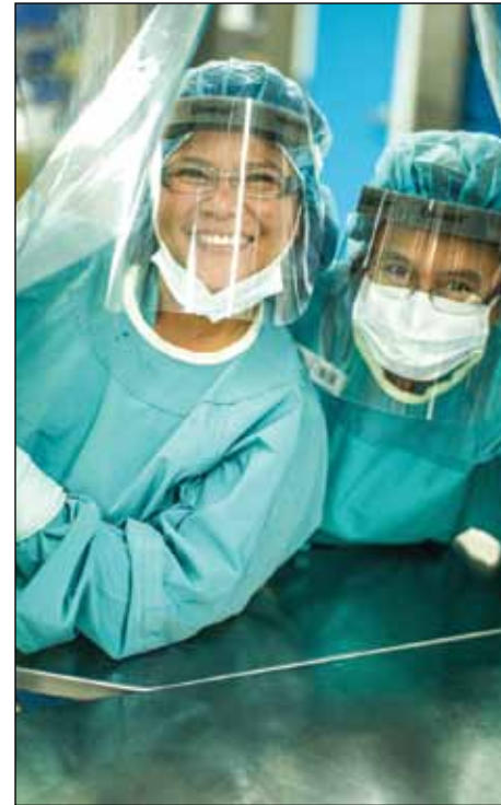
Covenant Health staff members often comment that they feel like they're part of a larger family.

Covenant, for example, is launching a new self-driven learning environment in 2014 that will interconnect the entire