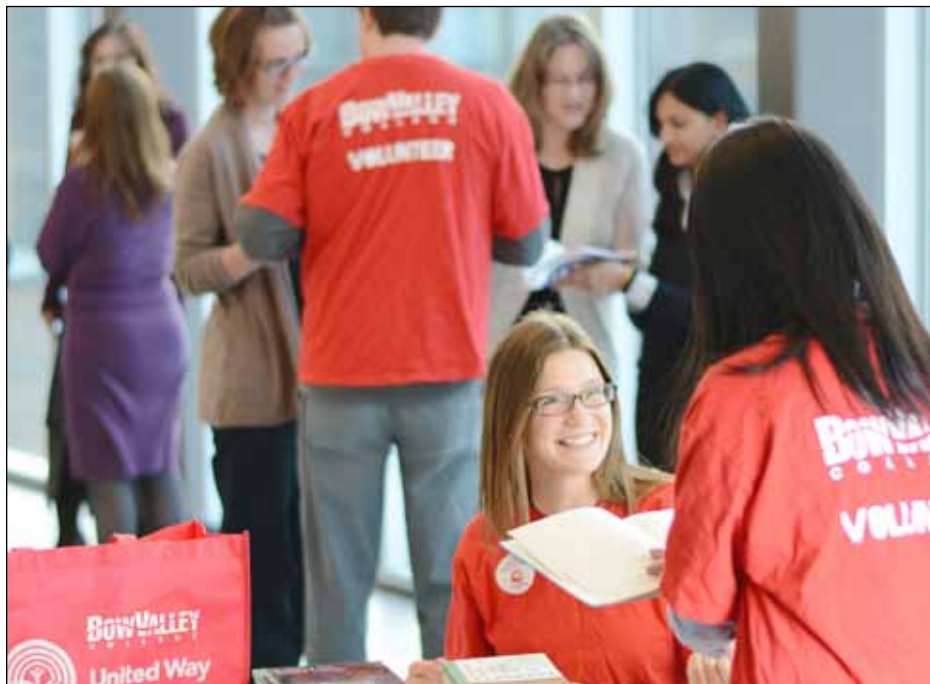
Bow Valley College staff are rooted in their communities, giving personal time to more than 80 community organizations throughout southern Alberta.

"We are a very collaborative group of people," he notes. "There is a joint responsibility across the college to ensure that all students are successful."