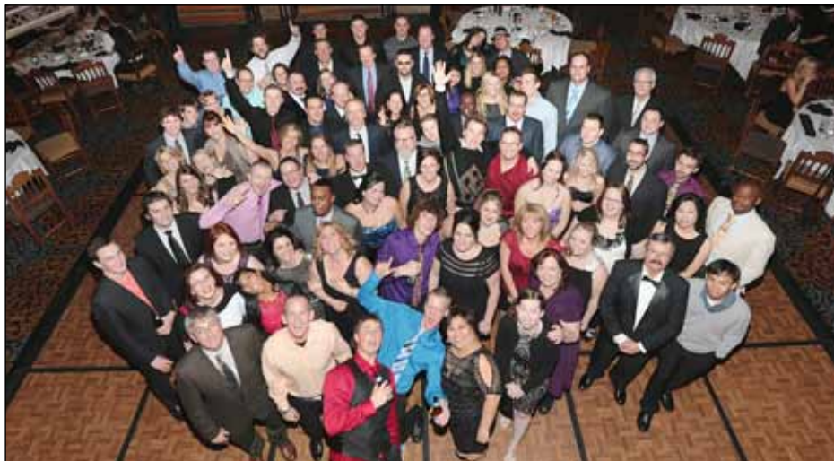
Hallmark Tubulars employees celebrate during the company's 2013 Christmas party at Fairmont Banff Springs.

"Hallmark has an ability to hire 'the right fit' for our organization."