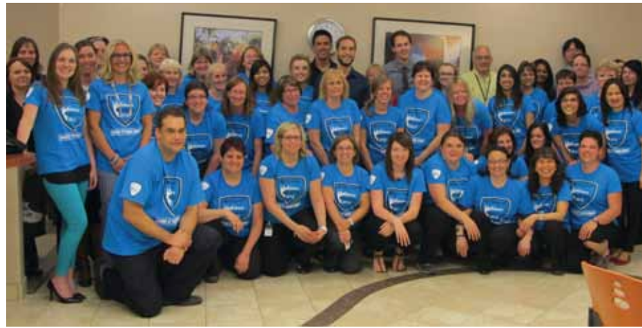
More than 80 per cent of Alberta Blue Cross staff members took part in the company's Wellness Challenge, which encouraged physical wellness through daily fitness challenges.

Alberta Blue Cross, for example, operates various on-site fitness programs.