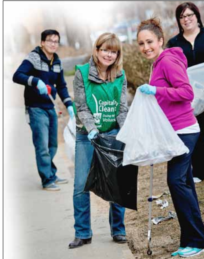
WCB — Alberta employees support their community by participating in the Capital City Clean Up.

"We are very supportive of each other. We take care of each other, so that we're able