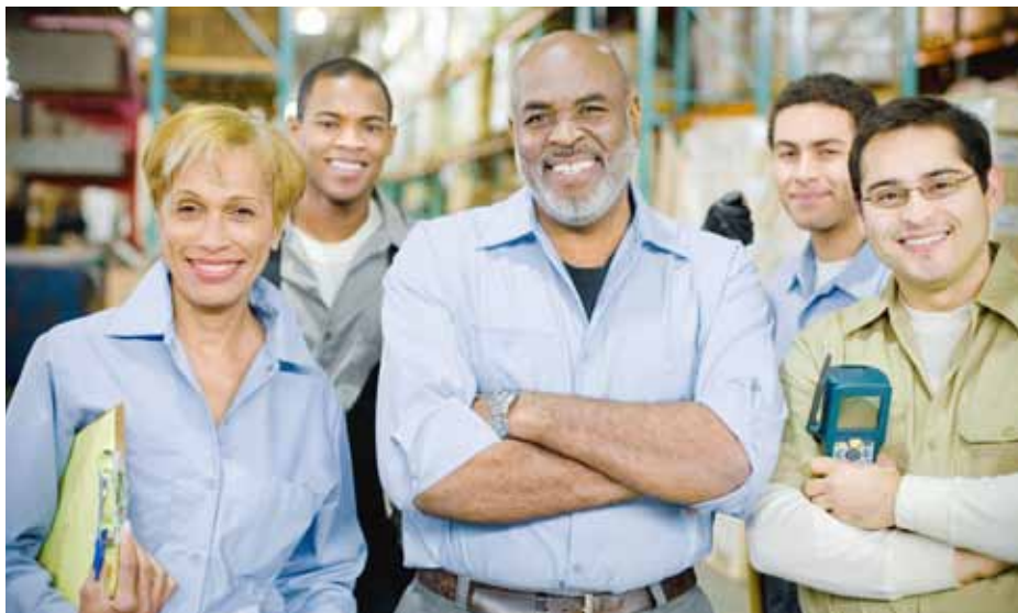
To make the grade as one of Canada's Top 100 Employers, companies must offer attractive compensation and benefits, plus other popular perks.

Employers who make the Top 100 have to be competitive across all areas of compensation and benefits, Yerema says, and they must show the kind of corporate