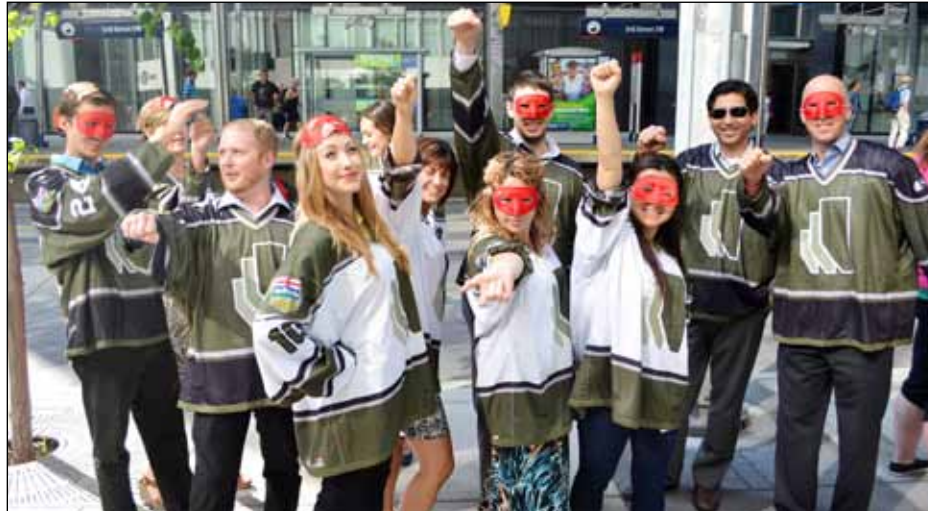
AUC employees at the 2013 United Way superheroes kick-off campaign.

"Consultation and collaboration with co-workers and external stakeholders