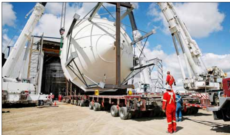
ENTREC Corporation works with the oil and natural gas, construction, petrochemical, mining and power generation industries. As such, the company offers its employees a diverse field of work.

“The cool thing about it is the companies that we have acquired were incredibly suc-