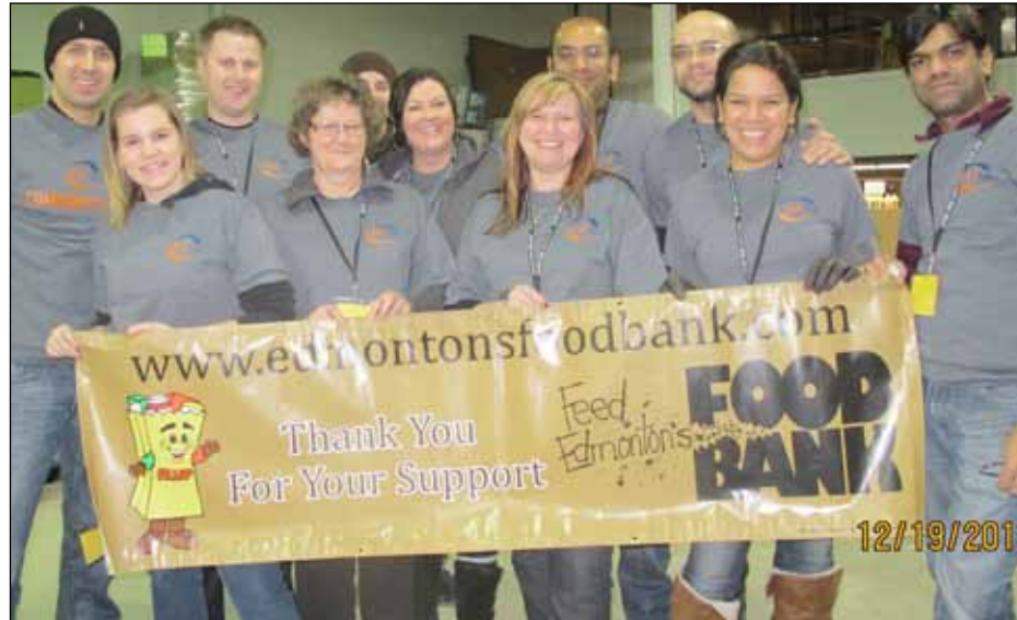
AIMCo launched its Community Investment Program in 2013, and employees have long supported a variety of causes.

To help meet its clients' goals, AIMCo has focused its efforts equally on attracting the top investment and operations professionals to the organization. The office is also thoughtfully designed to maximize efficiencies and the flow of information between