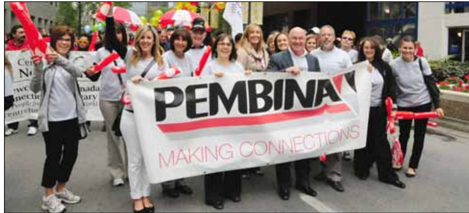
Pembina encourages its staff to be active in the communities where it operates.

attrition rate is much lower than its peers — 81 employees have currently put in a minimum of 25 years with the company.