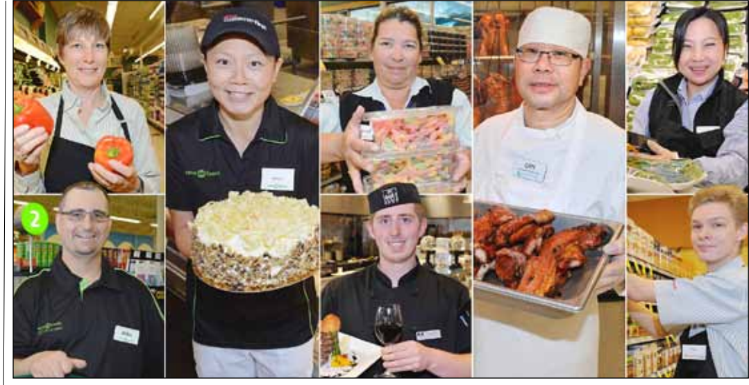
Overwaitea Food Group encourages entrepreneurship by empowering all 14,000 team members to make decisions and do what is right for their customers. People love working in an environment where there is a genuine entrepreneurial spirit.

"Typically, in this industry, if you're hired