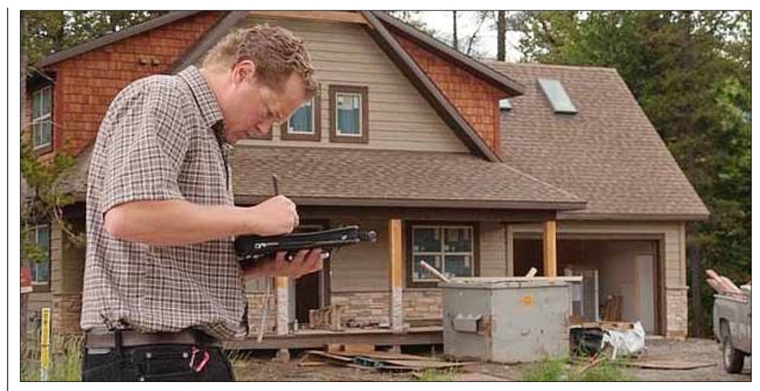
BC Assessment employees and their managers agree on a work schedule each month that meets collective agreement requirements while also providing a good work-life balance.

"Our employees and their managers can agree on a flexible work schedule for the