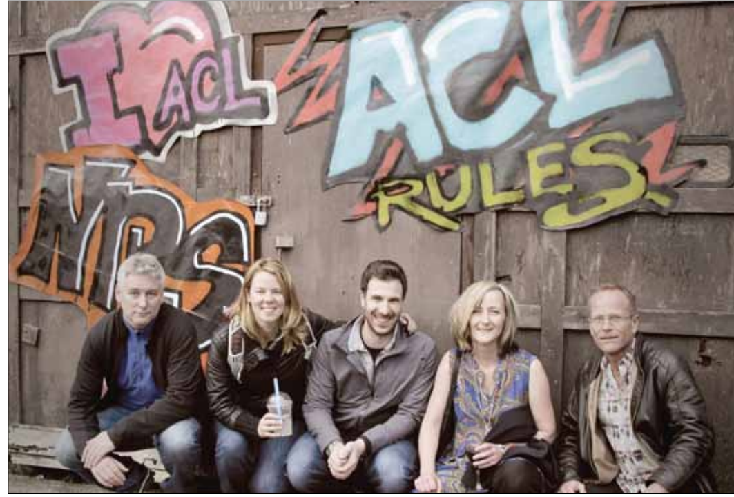
ACL employees gather to celebrate the launch of their governance, risk management and compliance (GRC) product.

"Our ability to disrupt our category starts with our ability to lead change from the inside out. If you want to get off the treadmill of mediocrity' and join a company where you can truly make a global difference from Vancouver, you need to be at ACL."