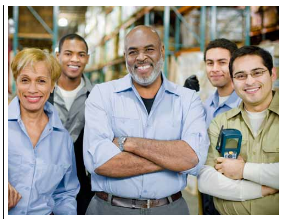
To make the grade as one of Canada's Top 100 Employers, companies must offer attractive compensation and benefits, plus other popular perks.

balance, while experienced hires tend to examine pension plans, family-friendly benefits and long-term security.